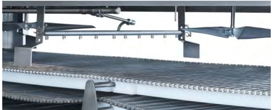
Cryogenic tunnel with continuous belting.