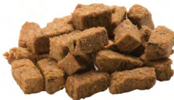
Freeze-dried pet food – chicken and vegetable.